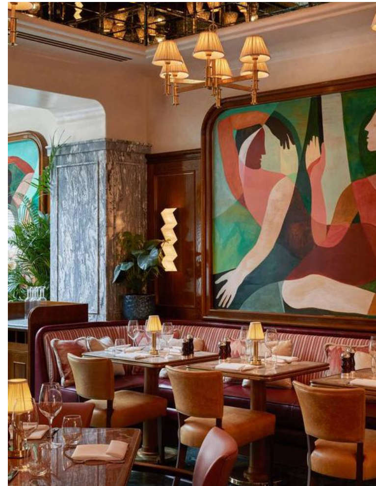
warm color palette