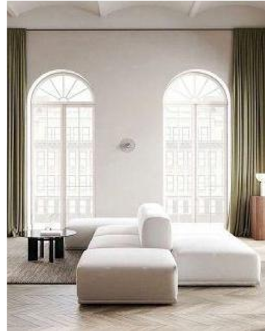
THROUGH MODULAR SOFA