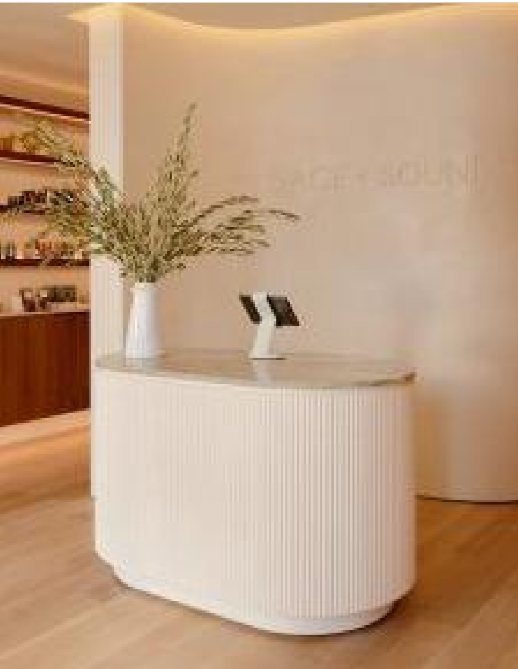
RIBBED WITH MARBLE TOP