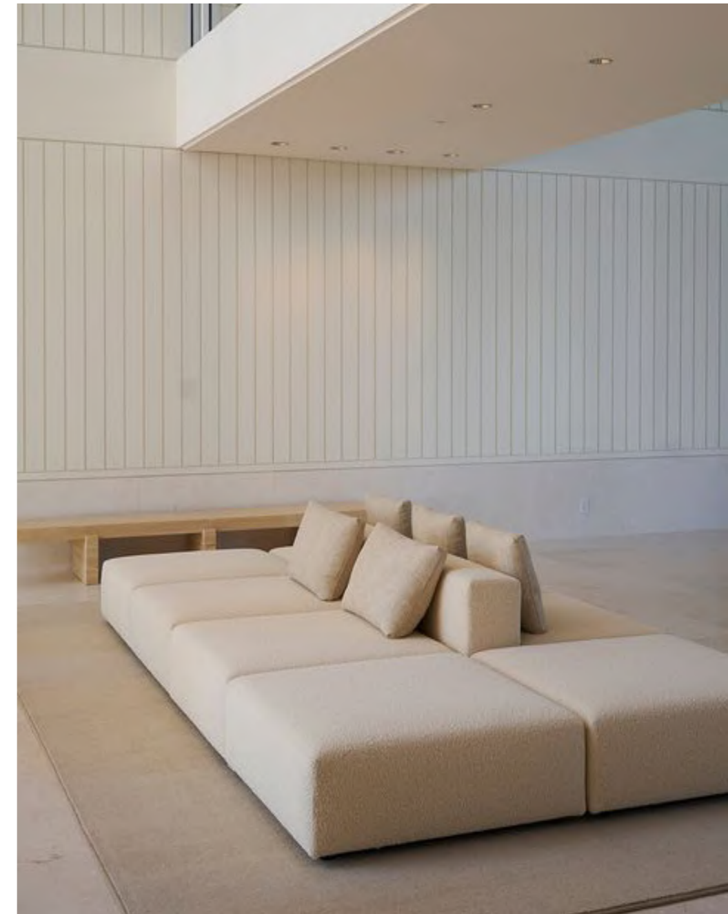
FURNITURE modular sofas