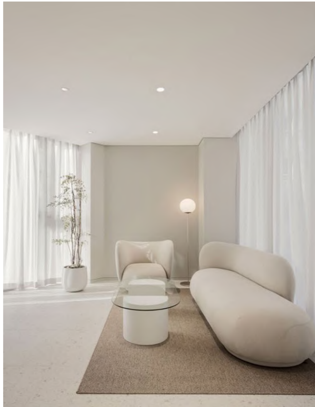
FURNITURE sofas, greenery, floor lamps, side tables