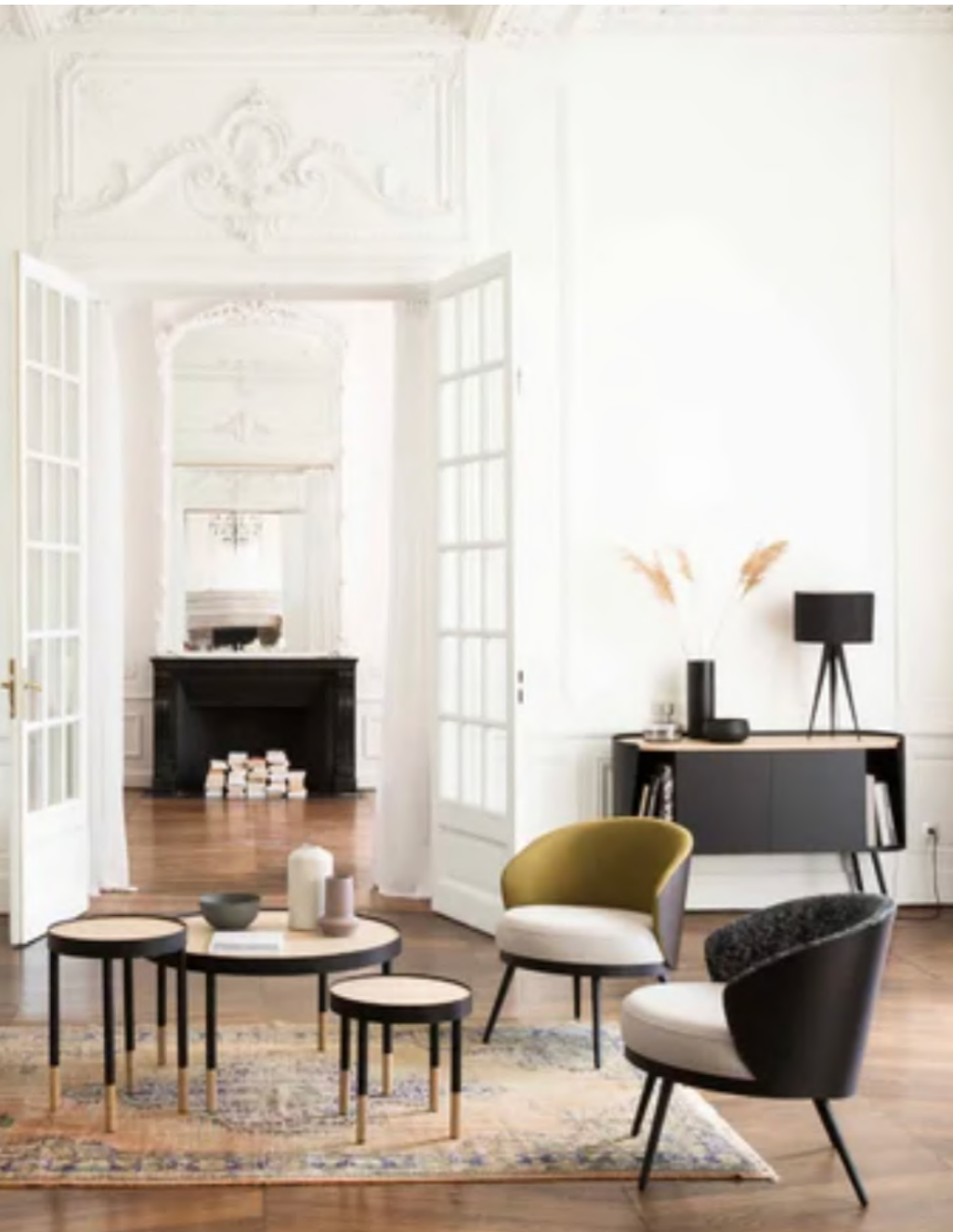
FURNITURE armchairs, small side tables, consoles