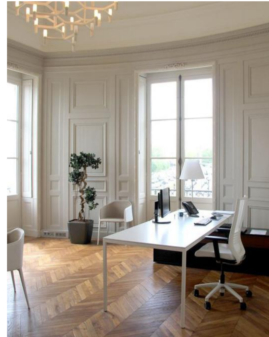
SIMPLE AND LINEAR