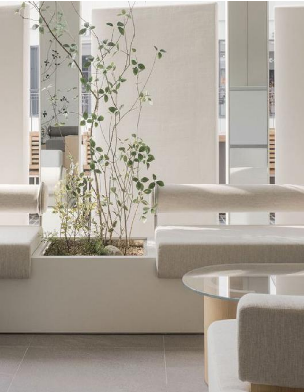
THROUGH GREENERY AND BANQUET SEATING