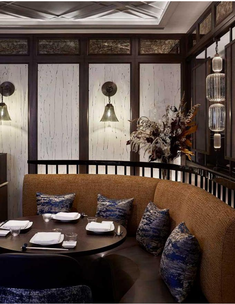
Kyubi Restaurant - The Arts Club